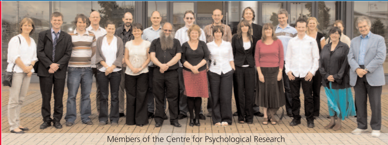
Members of the Centre for Psychological Research